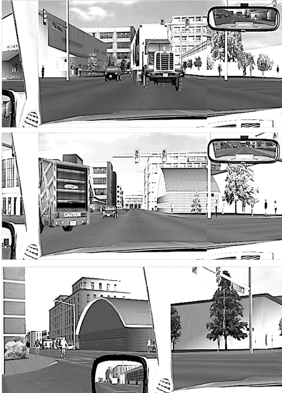
Figure 1. Views of the Three Scenario Types. From Top to Bottom, Type 1: Semi, Type 2: Lead Vehicle, and Type 3: Pedestrian