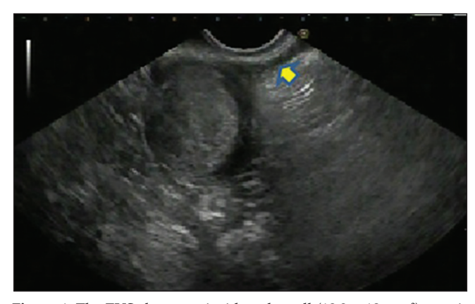
Figure 1. The EUS shows an incidental small ( 18.3 \times 18 \text{ mm}^2 ) gastric hypoechoic SELs arising from the fourth layer (arrow, MP) suggesting GIST. EUS-assisted fine-needle aspiration (FNA) was performed and the IHC analysis revealed GIST

At present, although EUS-FNA is considered the procedure of choice for preoperative diagnosis of GIST by IHC analysis of the sample for c-KIT, [24,27] it provides inadequate material in up to 33.3% of the cases. [28,29] In particular, smaller tumors are technically more difficult to obtain adequate histological samples compared to larger ones.<sup>[27,30]</sup> In the study by Akahoshi et al., the reported diagnostic yields for tumors less than 20 mm, 20 mm-40 mm, and 40 mm or more were 71%, 86%, and 100%, respectively, when only the adequate specimens were considered. [27] The literature shows discrepant rates of sample adequacy, ranging 58%-81.3% with EUS-FNA in upper GI SELs, which influence the final yield for GIST diagnosis. [27,31-33] One of the reasons for this discrepancy may be the presence of a cytologist for a rapid onsite evaluation (ROSE) of the sample in some studies. A recent study reported a sampling adequacy reaching 100% in both the <20 mm and the ≥20 mm groups of upper GI SELs; with a sensitivity of 81.3% for the diagnosis of