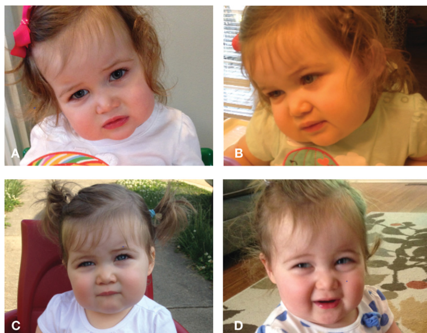
Figure 3. Head tilt, pre- and posttreatment with riboflavin supplementation. (A) Three weeks pretreatment; (B) day 2 of treatment; (C) 3 wk posttreatment; (D) 4 wk posttreatment.

forearm strength had improved (power 3/5). Immediately upon initiating riboflavin therapy no new symptoms or further decline in any pretreatment symptoms were observed.