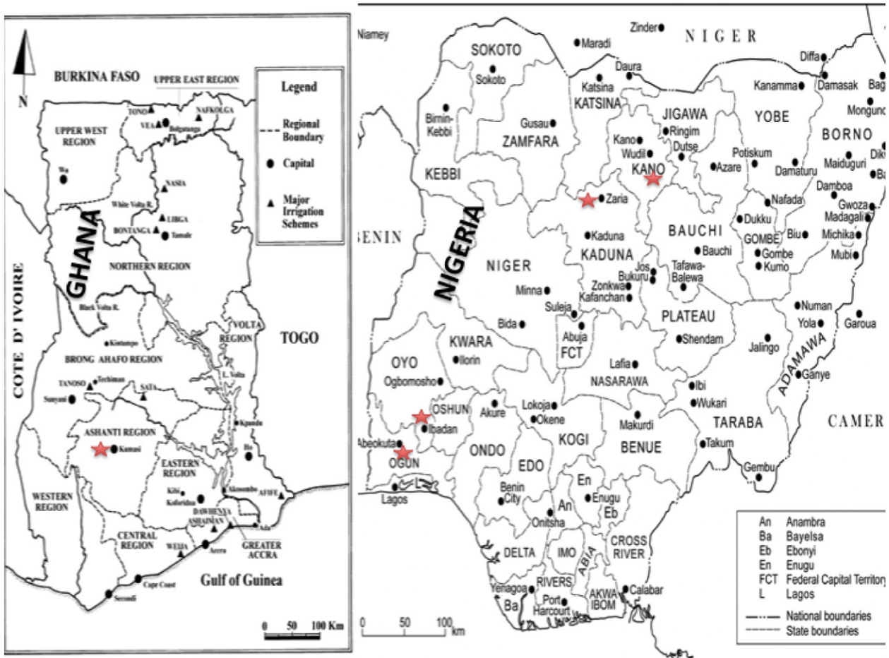
Fig. 1. Map showing 5 study sites (indicated by red stars).

Participants will be recruited from five Tertiary referral medical centers in West Africa namely the Komfo Anokye Teaching Hospital (KATH) in Kumasi, Ghana; the University College Hospital (UCH), Ibadan, Nigeria; Federal Medical Centre (FMC), Abeokuta, Nigeria; Ahmadu Bello University Hospital (ABUH), Zaria, Nigeria and Aminu Kano Teaching Hospital (AKTH), Kano, Nigeria (Fig. 1). Kumasi where KATH is situated is the principal city of the Akan tribe in central Ghana and serves a population of 4 million. The Akan language is spoken by 50% of the Ghanaian population. UCH and FMC situated in Ibadan and Abeokuta respectively are located in Southern Nigeria and serve a combined population of 4 million Nigerians of predominantly Yoruba ethnicity. Yoruba is a trans-border language spoken by 30 million Nigerians. ABUH and AKTH in Zaria and Kano provide health care services to 15 million Nigerians of mainly Hausa and Fulani descent. All these study sites have consultant