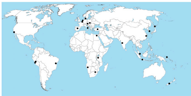
Fig. 1. Map of the 24 study site locations.

features in laughs involving higher proportions of periodic components (i.e., increasingly voiced), and a predominantly egressive airflow. This pattern is different from laugh-like vocalizations of our closest nonhuman relative, Pan troglodytes , which incorporate alternating airflow and mostly noisy, aperiodic structure (2, 16). In humans, relatively greater voicing in laughs is judged to be more emotionally positive than unvoiced laughs (18), as is greater variability in pitch and loudness (19). People produce different perceivable laugh types [e.g., spontaneous (or Duchenne) versus volitional (or non-Duchenne)] that correspond to different communicative functions and underlying vocal production systems (3, 20–22), with spontaneous laughter produced by an emotional vocal system shared by many mammals (23, 24). Recent evidence suggests that spontaneous laughter is often associated with relatively greater arousal in production (e.g., increased pitch and loudness) than volitional laughter, and contains relatively more features in common with nonhuman animal vocalizations (20) (Audios S1–S6). These acoustic differences might be important for making social judgments if the presence of spontaneous (i.e., genuine) laughter predicts cooperative social affiliation, but the presence of volitional laughter does not.