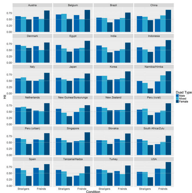
Fig. 2. Rates of correct judgments (hits) in each study site broken down by experimental condition (friends or strangers), and dyad type (male–male, male–female, female–female). Chance performance represented by 0.50. For example, the bottom right graph of the United States results shows that female–female friendship dyads were correctly identified 95% of the time, but female–female stranger dyads were identified less than 50% of the time. Male–male and mixed-sex friendship dyads were identified at higher rates than male–male and mixed-sex stranger dyads. This contrasts with Korea, for example, where male–male and mixed-sex friendship dyads were identified at lower rates than male–male and mixed-sex stranger dyads. In every society, female–female friendship dyads were identified at higher rates than all of the other categories.

Across all participants, the overall rate of correct judgments in the forced-choice measure (friends or strangers) was 61% (SD = 0.49), a performance significantly better than chance ( z = 40.5 , P < 0.0001 ) (Fig. 2 and SI Appendix, Table S3 ). The best-fitting model was a generalized linear mixed model by the Laplace approximation, with participant sex as a fixed effect, familiarity and dyad type as interacting fixed effects, participant and study site as random effects, and hit rate (percent correct) as the dependent measure (Table 1). Participants ( VAR = 0.014 ; SD = 0.12 ) and study site ( VAR = 0.028 ; SD = 0.17 ) accounted for very little variance in accuracy in the forced-choice measure. Familiarity interacted with dyad type, with female friends being recognized at higher rates than male friends ( z = 42.96 , P < 0.001 ), whereas male strangers were recognized at higher rates than female strangers ( z = -22.57 , P < 0.0001 ). A second significant