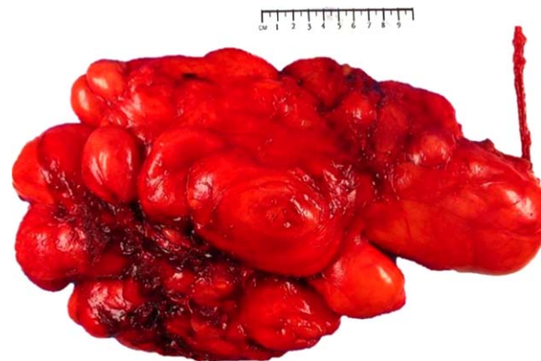
Figure 1. Large bosselated ALT which appears to be completely excised and covered by a thin film of loose fibrous tissue (marginal excision). Maximum dimension of tumour = 240 mm.

In addition to the 90 cases of ALT included in the primary study ( vide supra ), an extended search of our archive revealed an additional 175 cases giving a total of 265 cases that presented to the RNOH between 1997 and 2014. Of these, 155 cases presented after 2009 and, therefore, had limited follow-up. Furthermore, 18 of this extended group presented at RNOH with recurrent disease. One of these recurrent cases (thigh) presented at RNOH 40 years after the first excision. Twenty-six (including eight in the primary study) of the 265 (10%) cases presented with recurrent ALT: 19 (73%) recurred once as ALT and 7 (27%) recurred more than once as ALT: 3 of the latter ( n = 7 ) presented as secondary DDLS on the final recurrence. Details of these seven tumours are shown in Table 2. The mean size of the recurrent tumours was 143 mm (range 40–250 mm). Only two cases measured less than 100 mm. The majority (89%) of these tumours were resected with a complete/marginal excision margin.