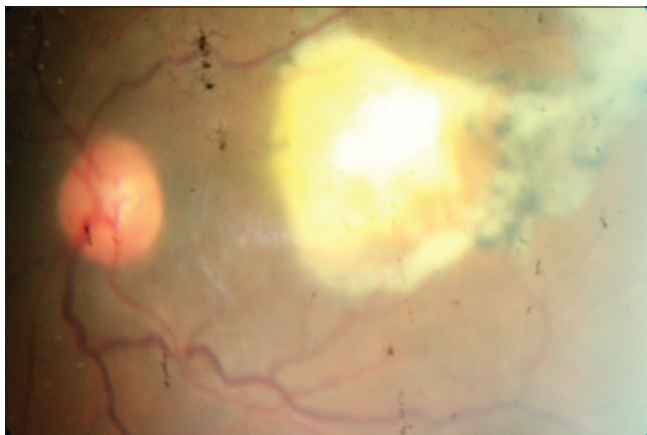
Figure 1. An active retinochoroidal lesion adjacent to a hyperpigmented scar with overlying vitritis causing the characteristic “headlight in the fog” appearance.

There was no significant difference in terms of marital status, education and occupation in patients with POT versus controls. The current study was performed in a suburban to rural setting which may account for the lower level of education in the majority of patients; there were 21 (30.4%) cases with no formal education. This may