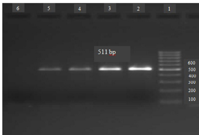
[Table/Fig-2]: Agarose gel electrophoresis of amplicons of common serotypes. Lane 1: Molecular weight marker; Lane 2: Positive control; Lane 3,4,5: Positive test samples; Lane 6: Negative control.