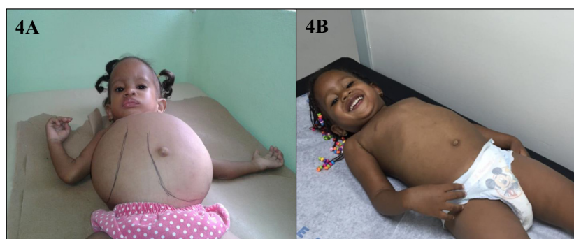
Figure 4. Dominican child with Gaucher disease. (A) Hepatosplenomegaly in a Dominican child with Gaucher disease prior to enzyme replacement therapy. (B) Regression of hepatosplenomegaly while on therapy with enzyme replacement therapy.

The Penal Code of 1948 (section 317) prohibits the performance of all abortions (Penal Code of the Dominican Republic 1948). Under the general principles of criminal legislation, however, abortion is permitted to save the life of the pregnant woman on grounds of necessity. Thus, in practice, both the legal and medical professions consider abortion performed to save the life of the woman to be