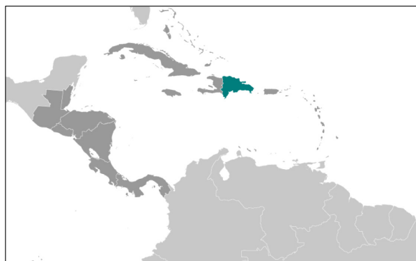
Figure 2. The Dominican Republic in the Caribbean.

The DR is a country of 48,442 km 2 or 18,704 miles 2 , roughly the combined sizes of the states of New Hampshire and Vermont. The country is politically divided into 31 provinces and Santo Domingo de Guzman is located in the National District. As part of the Greater Antilles of the Caribbean, it shares the island of Hispaniola with the Republic of Haiti as its western neighbor. The country borders on the north with the Atlantic Ocean and with the Caribbean Sea on the south. The Mona Passage, to the east, separates the DR from the Island of Puerto Rico (Figs. 2, 3). The estimated population for the DR in 2015 was just below 10.5 million with a large percentage of the population living in cities such as Santo Domingo and Santiago de los Caballeros, (See Table 1). An estimated 1–1.5 million Dominicans live outside the country. The population is mainly composed of different ethnicities, such as blacks (11%), mulattoes (73%), and whites (16%). This is the gross composition