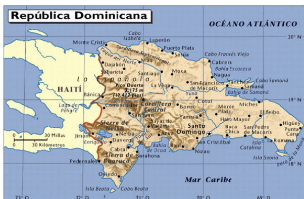
Figure 3. The political division of the Dominican Republic.