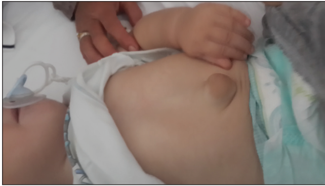
Figure 1: Umbilical hernia of the patient

and heart and is called Cantrell's syndrome. [3] Isolated LV diverticulum was reported in 30% of cases. Similarly, our patient had no associated abnormalities and other congenital heart defects were excluded by echocardiography. So, the patient was diagnosed as isolated LV diverticulum.