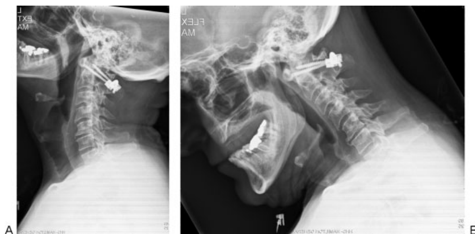
Fig. 4 (A) Late radiograph, extension. (B) Late radiograph, flexion.

the celestial spheres, is a ring-shaped structure formed by an anterior and posterior ring that are joined by two lateral masses. 27 This first vertebra of the spinal column lacks a vertebral body or spinous process. Its anterior arch contains a central enlargement known as the median anterior tubercle to which the longus colli muscular attaches, as well as the fovea dentis, a cartilaginous recession on its posterior surface that articulates with the odontoid process of the second vertebra to form a synovial joint. The outer half of the posterior ring contains bilateral grooves known as the sulcus arteriae, along which the vertebral artery and first spinal nerve travel, as well as a central enlargement known as the median posterior tubercle, which attaches to the nuchal ligament. The trapezoidal-shaped lateral masses have superior and inferior articular facets that communicate with the articular surfaces of the occiput and axial vertebra, respectively. The thick TAL attaches to the medial surfaces of the lateral masses and helps maintain the odontoid process in contact with the fovea dentis of the axis. The combination of these anatomic features allows the atlas to contribute to