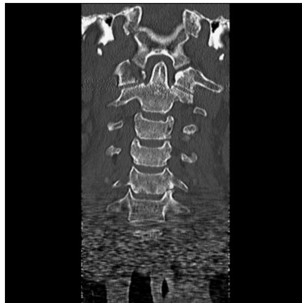
Fig. 2 Coronal plane computed tomography scan demonstrating the displaced injury at C1.

Postoperatively, the patient wore a rigid cervical orthosis for 6 weeks followed by a gradual return to full activities. At 6-month follow-up, he was pain-free, fully active, and working with ~20 degrees loss of cervical rotation to the left compared with a full 90-degree arc on the right. CT scan (→ Fig. 3A, 3B ) and dynamic radiography (→ Fig. 4A, 4B ) demonstrated no atlantoaxial instability with good fracture alignment with preliminary osseous bridging of the fracture. The patient was allowed to resume full vocational activities with no restrictions and has not since returned to clinic.