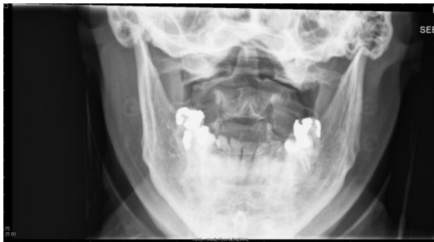
Fig. 1 Anteroposterior radiograph at 3 weeks postinjury showing widening of C1.

We performed a structured literature search in the English language using the Medline, PubMed, Embase, and Cochrane library databases from the available periods of 1966 to 2014 using the following combinations of keyword terms: “isolated” OR “solitary,” AND “atlas,” AND “fracture” OR “fixation” OR “treatment.” The search was expanded using the “find similar” and “find citing articles” features of the Medline database and the “related articles” feature of the PubMed database. Duplicate studies were removed, leaving 491 articles, of which 292 were excluded based on their titles and 157 based on their abstracts. The remaining 42 articles were read, and we excluded 35 based on our inclusion and