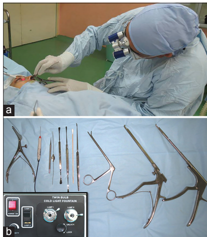
Figure 1: (a) Surgeon's position for performing nonendoscopic endonasal dacryocystorhinostomy; (b) instrumentation for nonendoscopic endonasal dacryocystorhinostomy

Eighteen eyes had persistent epiphora after primary surgery. Revision NEN-DCR was performed in 16 eyes at a median interval of 142 days after primary surgery. In 10/16 (62.5%) eyes at revision, the ostium was obstructed by dense granulation tissue which was excised and MMC 0.04% applied for 3 min followed by bi-canalicular intubation. Overall, after revision surgery, 13/16 (81%) eyes were relieved of epiphora. Finally, functional success was achieved in 129/134 (96.2%) eyes and anatomical success in 106/109 (97.2%) eyes at a median follow-up of 7 months (range: 3–15 months).