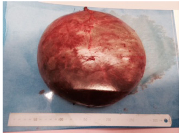
Figure 4: The intact excised pseudocyst.

Macroscopic histology showed an intact retroperitoneal cyst measuring 24 \times 21 \times 13 cm containing turbid fluid and weighing 4035 g. Microscopically the cyst wall was lined by foamy macrophages and fibrin, with some chronic inflammation noted in the wall as well. An epithelial or mesothelial lining was absent in