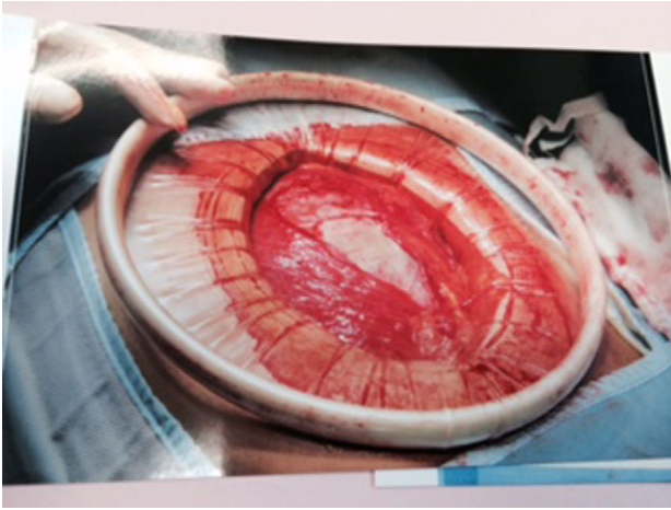
Figure 5: A large Alexis wound retractor was utilized. In the image, centrally, the pseudocyst can be identified prior to retrieval.

epithelium that is not histologically similar to either pancreatic or adrenal tissue. In chronic cases, the surrounding fibrous capsule undergoes calcification and has been described as 'resembling an eggshell' [3].