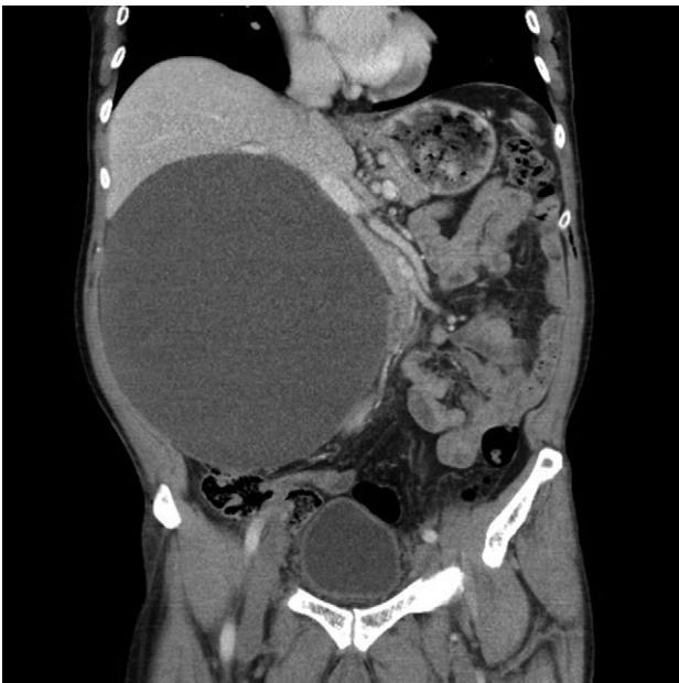
Figure 2: Coronal section of the retroperitoneal pseudocyst.

retroperitoneal cavity. Medially, the cyst was attached to the small bowel mesentery and extended from immediately below the liver to the pelvic brim. The cyst was mobilized free and retrieved intact using both blunt and sharp dissection. Intraoperatively, the procedure progressed uneventfully. Figures 4 and 5 show operative retrieval of the pseudocyst and the macroscopic appearances of the specimen.