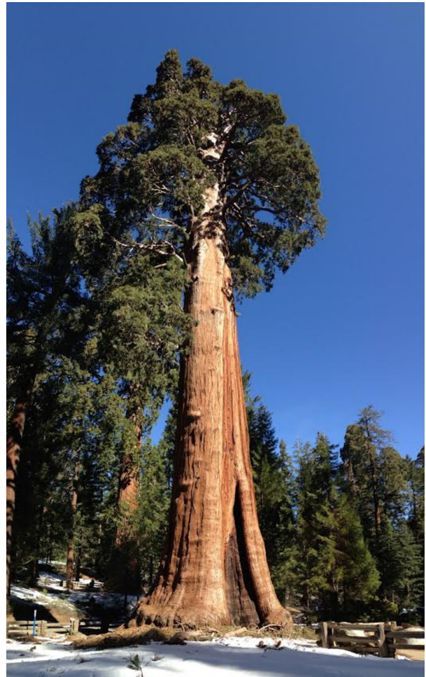
Figure 1. “The Sentinel” giant sequoia in Giant Forest, Kings Canyon National Park.

We focus here on demographic fluctuations and their effect on genetic structure of giant sequoia ( Sequoiadendron giganteum [Lindl.] Buchholz), a paleoendemic species that occupies the western slope of the Sierra Nevada Mountains of California (Fig. 1). The fossil record suggests that during the Pliocene, populations were present along the eastern flank of the Sierra Nevada, in what is now Nevada (Axelrod 1986). Today, giant sequoia forms a series of groves that are more or less continuous in the southern range, but north of the Kings Canyon, the groves are isolated and well separated. This has led to speculation as to whether isolation of the northern groves is the result of (1) long-distance seed dispersal; (2) climatic changes that reduced a once more continuous