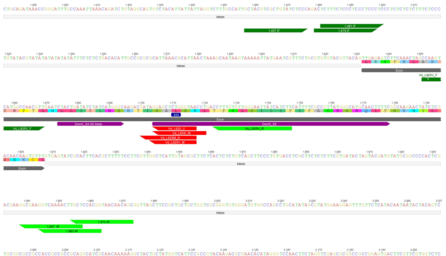
Fig 1. Intron-exon-intron section of the V. destructor VGSC Domain II. Section including the linker between transmembrane segments 4 and 5 (DomII_S4-S5) and the transmembrane segment 5 (IIS5) [in magenta]. Intron [light grey] and exon regions [dark grey], as well as the annealing positions for primers [green] and TaqMan® probes [red] are shown. Numbering corresponds to that in Accession KC152655. The position of the residue 925 of the channel protein is highlighted in blue.

Genomic DNA from at least 2 individuals per sample was used as a template to PCR-amplify fragments covering the relevant region of domain II (Fig 1) following a two-step nested PCR strategy [27]. For the primary amplification (PCR1), the primers were 1457iF (5'-GCTACGT CGCTGTATCTCCC-3') and 1973iR (5'-GCTGTTGTTACCGTGGAGCA-3') and for the secondary amplification (PCR2), the primers were 1479iF (5'-ACTCTTTCTCCCTCCCTCCC-3') and 1963iR (5'-CCGTGGAGCAAGTTTTGACC-3'). For each amplification, the reaction mixture contained 0.4 μM of each primer, 15 μl of DreamTaq Green PCR Master Mix (2×) (Thermo Scientific), 12 μl of distilled water and 1 μl of genomic DNA (or PCR 1) to a final volume of 30 μl. Cycling conditions were: 94°C for 1 min followed by 35 cycles of 94°C for 20 s, 61°C for 20 s and 72°C for 45 s, and final extension at 72°C for 5 min. The PCR fragments were precipitated with ethanol and direct sequenced (Eurofins MWG Operon, Germany) using the primers 1481iF (5'-TCTTTCTCCCTCCCTCCCTC-3') and 1957iR (5'-AGCAAGTTTTGA CCTTCGCC-3'). All primers were designed and the sequences analysed using Geneious software (Version 8.1, http://www.geneious.com/ ).