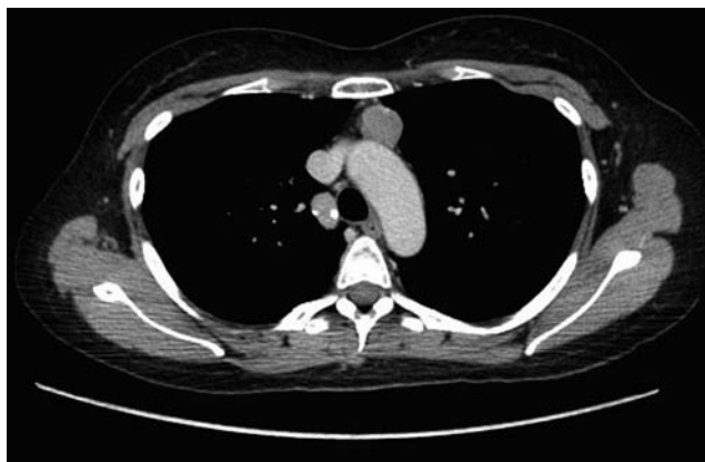
Figure 1 CT slice demonstrating anterior mediastinal nodule.

Despite serum cortisol levels in excess of 1000 nmol/L at presentation, following the period of initial investigation, this level of hypercortisolaemia was not seen again on repeated biochemical testing. The patient continued to run weekly serum cortisols at 09:00h of approximately 250–350 nmol/L, suggesting that the period of hypercortisolaemia had remitted. The impression that the ACTH source was behaving in a periodic secretory pattern was therefore derived from the detailed presenting complaint obtained from the patient and her records, and the demonstrable change in the degree of hypercortisolaemia in the short time frame between her