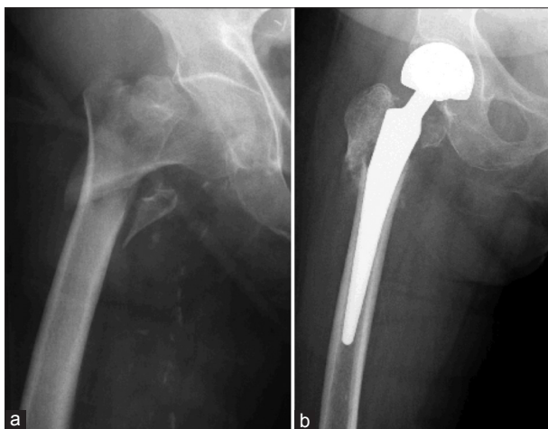
Figure 1: 78-year-old female patient, unstable intertrochanteric femur fracture due to fall (a) → the figure on the left, treated by uncemented hemiarthroplasty (b) → the figure on the right

There was no significant difference between mean age of patients with intertrochanteric fracture treated by hemiarthroplasty in all three groups [Table 1].