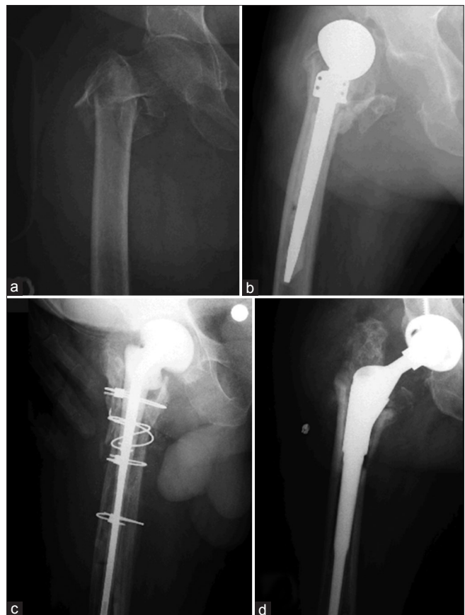
Figure 2: 81-year-old male patient, treated by cemented hemiarthroplasty (a), 9 months later, he is infected, and the hip is dislocated (b) thus, the prosthesis is removed, and antibiotic covered spacer is placed into the femur (c). Finally, he is treated with total hip arthroplasty with long femoral stem (d)