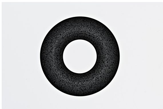
Figure 2 A schematic of the KAMRA inlay design.

Given that this is an additive procedure (ie, no corneal tissue is removed), it can be combined with refractive laser vision correction procedures where the eyes are made emmetropic – here the inlay is situated in a lamellar pocket at least 100 \mu\text{m} beneath the initial laser in situ keratomileusis (LASIK) flap. 14 Further, it can be implanted in previously pseudophakic eyes, which has been shown, albeit in a few cases, to produce a significant improvement in near acuity without affecting distance acuity. 15 Based on an eye model, it has been suggested that the best depth of focus is achieved