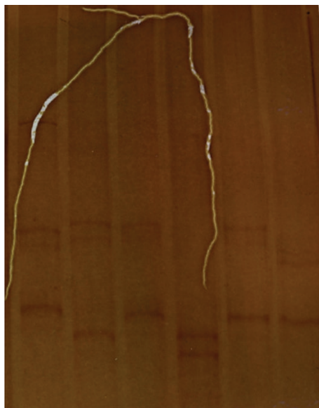
Lane 1 Lane 2 Lane 3 Lane 4 Lane 5 Lane 6

FIGURE 2: Single-strand conformational polymorphism profiles of the Flavivirus PCR products. Templates used with their EMBL code were Lane 1, HE716845, Lane 2, HF543929, Lane 3, HF543928, Lane 4, HF543926, Lane 5, HF543925, and Lane 6, HF543924. Lane 1, Lanes 3 and 5, Lane 2, Lane 4, and Lane 6 present five different SSCP profiles.