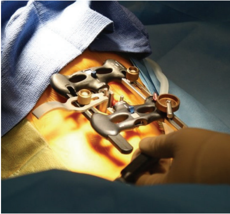
FIGURE 1: Intraoperative photograph of RAVINE.