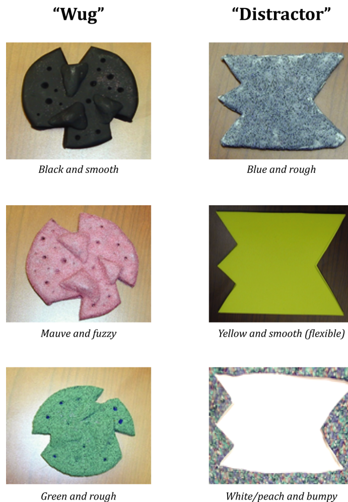
Fig 1. Noun class stimuli. Illustrates the exemplar "wug" and the distracter that were used during the 10 trials. Remaining stimuli were used during the generalization trials and varied by shape, color, and texture as illustrated above.

After a brief warm-up (naming simple objects, such as "cup" and "ball") a novel object (called a "wug") was presented to the child along with a distracter object. The shapes of these 2 objects were quite different (Fig 1). As part of the training, the experimenter named and