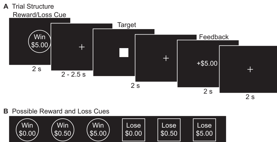
Fig. 1. The (A) trial structure and (B) possible reward and loss cues of the monetary incentive delay (MID) task used to examine reward and loss anticipation and outcome.

states induced by various classical music pieces (Mitterschiffthaler et al. , 2007). All participants used a visual analog scale ranging from 'Not at all' (0) to 'Very' (100) to provide happy, sad, excited, and tense ratings immediately before and after the mood induction.