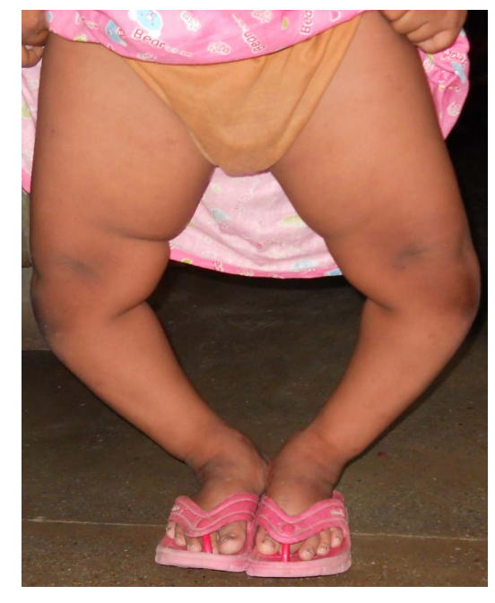
Figure 1 Child with bowing of both legs.

A significant number of infants may have physiological bowing of the lower extremities up to the age 2 years, which is characteristically painless and symmetrical, and resolves spontaneously without treatment, as a result of normal growth. Unlike