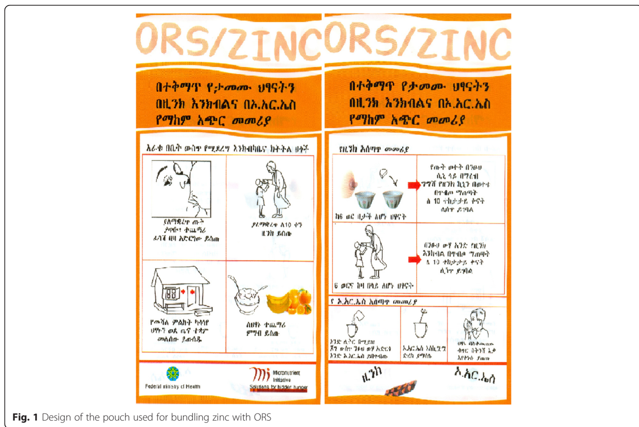
Fig. 1 Design of the pouch used for bundling zinc with ORS