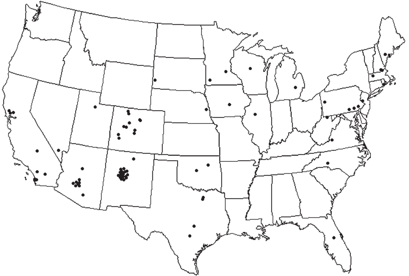
Fig. 2. Paid hot-air balloon tour crashes by state, United States, 2000-2011. • = Paid hot-air balloon tour crash. (No paid hot-air balloon ride crashes occurred in Alaska or Hawaii during this time period.)