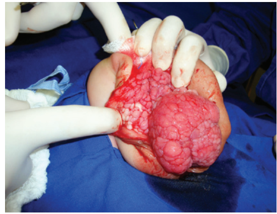
Figure 3. Lobulated mass after midline perineal incision

revealed a hamartoma composed of fibrous connective tissue with proliferation of capillares and blood vessels, nerve bundles, fibroblasts, epithelium, smooth muscle and irregular ductal formations, covered by urothelial. No complications were seen in the surgery. After 16 months of follow-up, the patient was in fairly good condition. His lower limb neurological function was normal. However, the patient has a continuous urinary leakage and his bowel reconstruction must occur in the future.