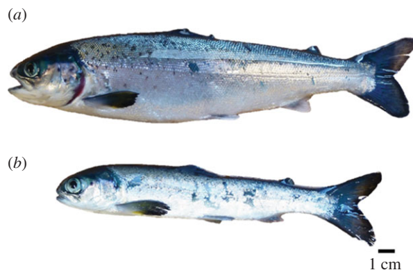
Figure 1. Representative pictures of healthy (a) and GS (b) fish from an aquaculture farm in the Langenuen Strait, Western Norway.