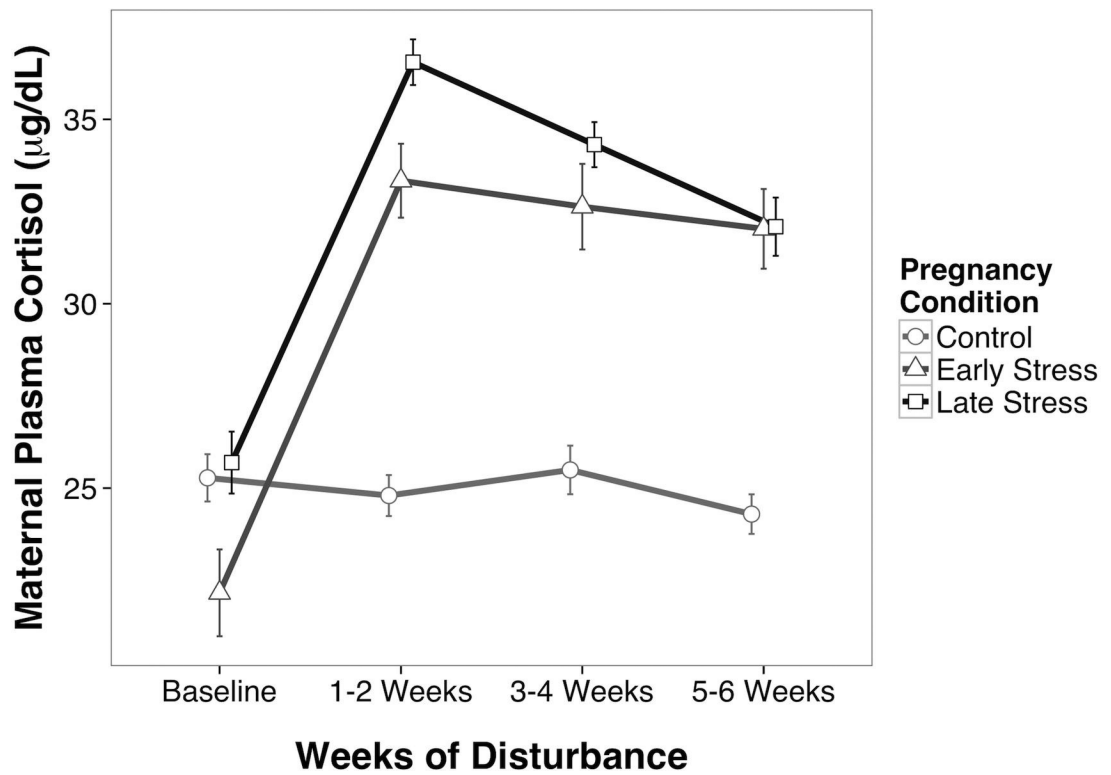
Fig. 1. Maternal cortisol response to acute disturbance during Early and Late Gestation. Stress manipulations significantly increased cortisol from Baseline levels. Cortisol levels were significantly higher in the Stressed females as compared to Undisturbed Control females sampled at identical 2-week intervals.