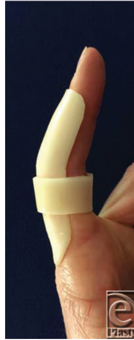
Figure 3. Immobilization of a volar plate injury with an extension-blocking splint (proximal interphalangeal joint in 20°-30° flexion).