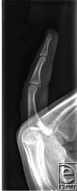
Figure 2. Radiograph demonstrating a volar plate avulsion fracture (Eaton type 3a).