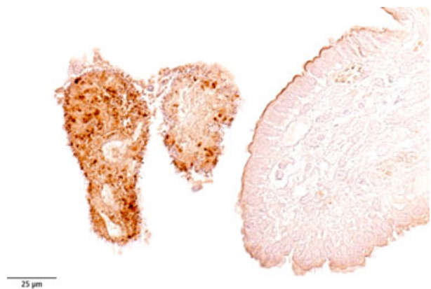
Fig 3. Immunohistochemical staining of a duodenal section collected from Dog #2. Many rod-shaped bacteria present on the necrotic villous tissue were strongly positive for a polyclonal chicken antibody raised against Clostridium spp.

All cultured Clostridium spp. were identified as C. perfringens by mass spectrometry using MALDI-TOF.