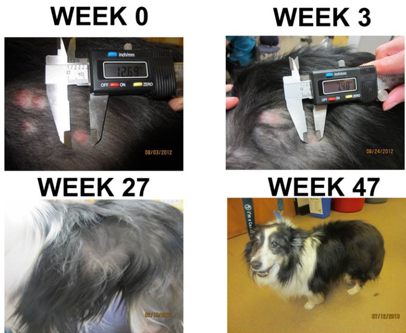
Fig 1. Photographs of the complete responder before treatment, and 3 weeks, 6 months, and 11 months after treatment. Thoracic radiographs continue to be normal.

developed dermatopathy. Biopsies were performed in 2 dogs and supported that the changes were consistent with drug-induced toxicity as opposed to PD. More specifically, histopathology in these 2 dogs disclosed mixed dermatitis and hyperkeratosis, without evidence of neoplasia. One dog was removed from the trial prematurely after the lesions did not resolve after a 21-day dose delay. This patient continued to have SD throughout the dose delay and then was lost to follow-up. Another dog that developed dermatopathic AE received a 20% dose reduction and the dermatopathy improved. This dog developed new target lesions 3 weeks later and was withdrawn. A biopsy was not