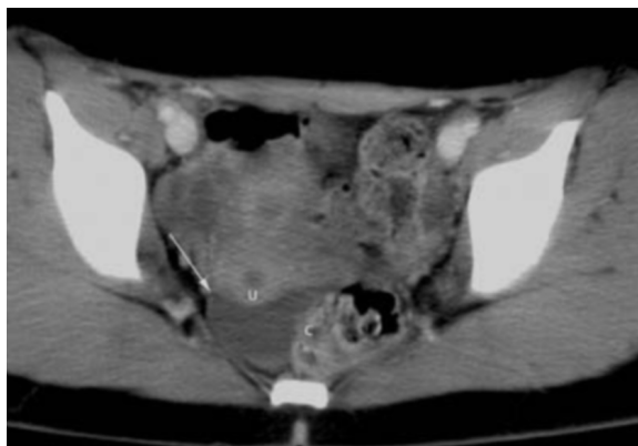
Figure 1. CT image shows free fluid forming a concave margin with the uterus (U) and sigmoid colon (C) and the peaked apex (arrow).

ing this pathologic condition and associated findings. While ultrasound remains a non-ionizing and inexpensive modality for detecting fluid collections within the abdominal cavity, computed tomography (CT) scans are also effective in detecting ascites and may have some advantages for areas blind to ultrasound due to overlying bowel gas. This study proposes the utility of a new radiographic sign, we have named the "Concave margin sign" for descriptive purposes, as it has been found useful to radiologists in Body CT at our institution.