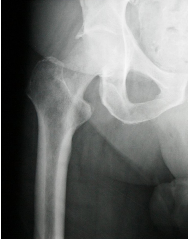
Figure 1. 70-year-old male with prostate carcinoma. AP radiograph of the proximal right femur, showing an ill-defined osteolytic lesion of the right femoral neck and intertrochanteric ridge.

family history was significant for a history of unknown type of cancers; his father died of such a cancer at the age of 45. Significant findings on physical examination included tenderness over the anterolateral region of the right upper thigh. The prostate was mildly enlarged and appeared to be smooth, normal in texture, and with no nodules by digital rectal exam. Laboratory data revealed a normal complete blood count and chemistry panel. Alkaline phosphatase was elevated at 210 U/L. A plain AP-view radiograph of the pelvis and right hip showed a osteolytic lesion in the superior aspect of the right femoral head (Fig. 1).