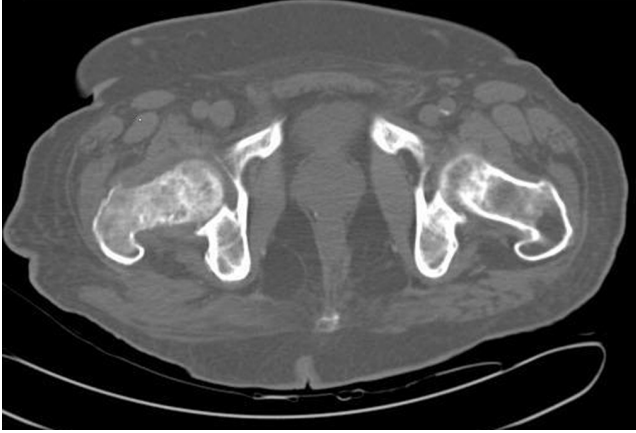
Figure 4. 70-year-old male with prostate carcinoma. Axial CT scan of the pelvis, showing mixed osteolytic lesion with sclerotic margins in right femoral neck.

CT confirmed the presence of a single lytic lesion of the right femoral neck with a partially sclerotic margin (Fig. 4).