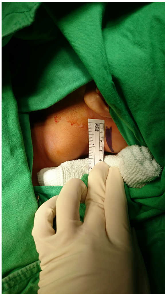
Fig. 2 Intraoperative findings: retroauricular hairline approach with a 3-cm skin incision in the hairline and via 7-cm skin flap tunnel