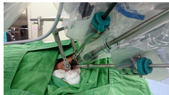
Fig. 3 Robot-assisted excision via a small retroauricular incision was facilitated by the application of the Yang's retractor

The treatment of cystic hygroma remains challenging for pediatric head and neck surgeons, especially when the parents are often concerned about the permanent cosmetic outcome. In addition, surgical excision carries the risk of damaging the surrounding nerves and blood vessels, scarring, and recurrence due to incomplete excision [6]. Other alternative treatment modalities developed with the intent of improving cosmetic outcome, or for patients who are poor candidates for surgery, including watchful waiting,