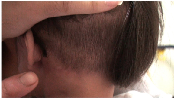
Fig. 4 Follow-up visit 3 months postoperatively showed the incision scar well hidden in the hairline

sclerotherapy, radiation, hormone therapy, the transoral approach, and endoscope-assisted excision [4, 6, 7].