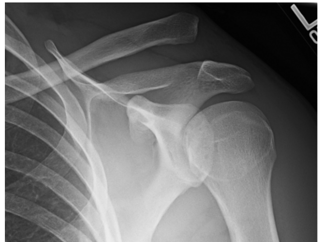
Figure 1. 32-year-old male with type III ACJ dislocation. AP radiograph shows superior dislocation of distal clavicle from ACJ, with increased coracoclavicular interval, indicating disruption of coracoclavicular ligaments of the lesion.

ACJ dislocation is a common injury that often affects young adults. Its sequelae range from an asymptomatic shoulder to one that is painful, with significant loss of strength in the affected upper limb. The management of ACJ dislocation is dictated by the type of injury. In general,