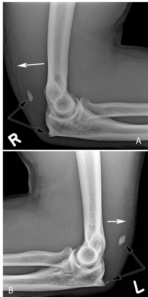
Figure 1. 42-year-old male with bilateral triceps tendon tear. A. Lateral view of the right elbow B. Lateral view of the left elbow. Black arrows depict ossific fragment and origin of avulsion. White arrows represent soft-tissue swelling.

The insertion and composition of the triceps tendon has been closely investigated in the recent literature. Cadaveric