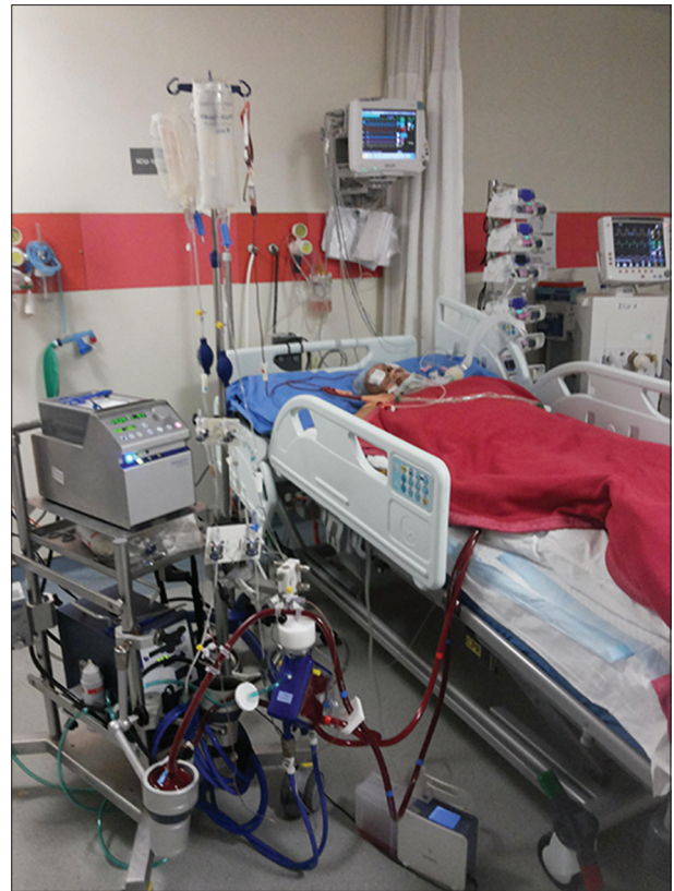
Figure 5: Patient on extracorporeal membrane oxygenation

Despite these contradictory findings, ECMO remains an important tool for managing life-threatening hypoxemia. It is usually used as a last resort in severe ARDS, and, therefore, its all the more essential to initiate ECMO timely in the course of the disease [Figure 5]. It should be used in refractory hypoxemia due to a