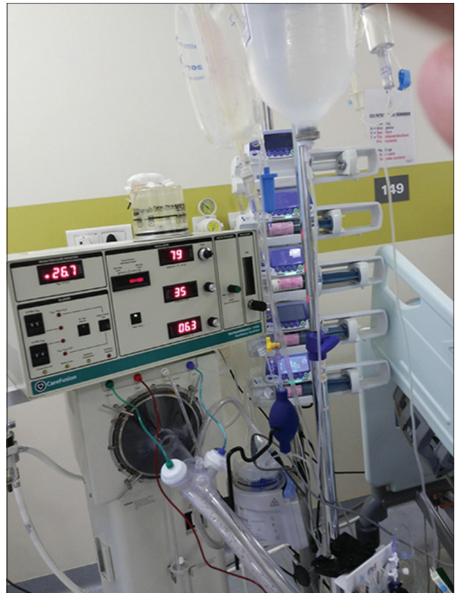
Figure 2: High-frequency ventilator

High-frequency oscillatory ventilation (HFOV) is a type of ventilation combining high respiratory rate (3–15 Hz, >900 breaths/min) and tidal volumes smaller than even the anatomical dead space volume, through the endotracheal tube [Figure 2]. An oscillatory pump is required for this purpose. [21-23] It basically maintains a constant distending MAP around which the oscillations take place. This strategy results in homogenous distribution of ventilation by maintaining a high MAP, reduces the risk of VILI and hyperinflation.