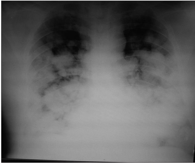
Figure 1: Chest radiograph of acute respiratory distress syndrome