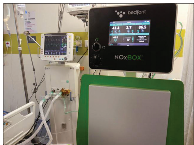
Figure 4: Inhaled nitric oxide being given to a patient on mechanical ventilation