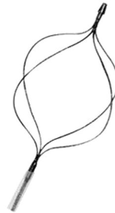
Fig. 3. Dormia basket forceps.

Previously rigid bronchoscopy was a natural choice for removal of tracheobronchial foreign bodies. But with greater availability of flexible bronchoscopes with technically advanced forceps, especially retrieving forceps, foreign bodies are being increasingly