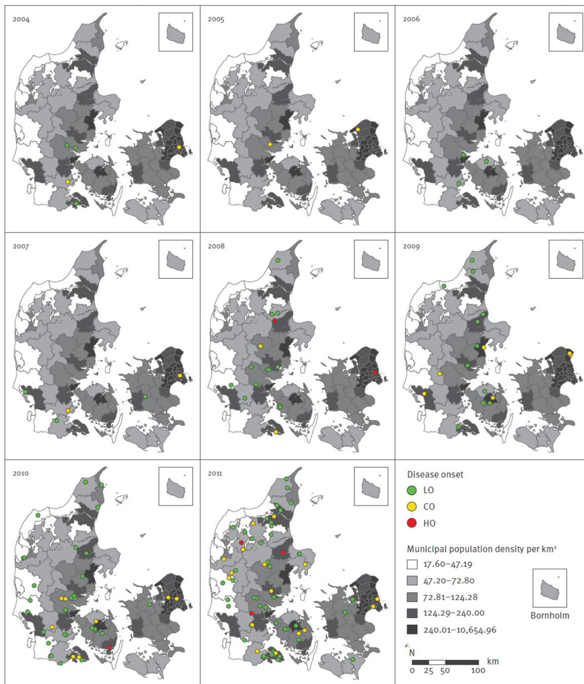
Figure 3. Geographical distribution of patients with meticillin-resistant Staphylococcus aureus (MRSA) CC398-IIa infection, Denmark, 2004–2011 (n = 148) CO: community-onset disease; HO, healthcare-onset disease; LO: livestock-onset disease. Each dot is placed randomly within a 5-km radius of the exact residential address within a given municipality of residence to protect anonymity of the patient. The municipal population density per km 2 is shown.