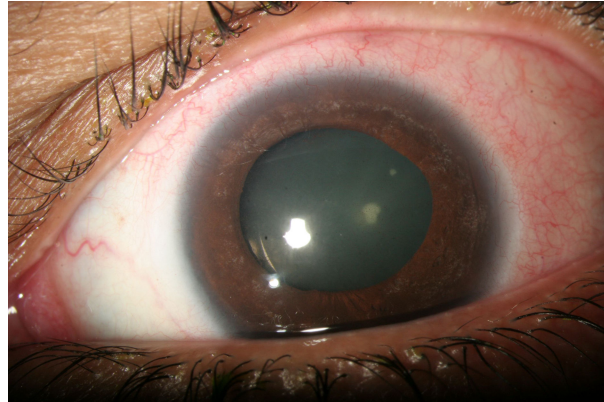
Figure 1. Anterior segment photo of the left eye showing a mid-dilated pupil (after management of the elevated intraocular pressure).

Two weeks postoperatively, the uncorrected visual acuity in the left eye improved to 20/30, and the IOP was 16 mm Hg. The corneal edema resolved. The ICL was well positioned, with a visible space that existed between the crystalline lens and the ICL. Pigment deposits were observed on the ICL surface (Figure 2). Anterior-segment optical coherence tomography (AS-OCT) of the left eye showed well-positioned ICL with