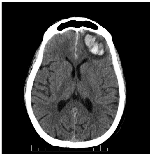
Figure 2: Computed tomography of the head, showing intracranial hemorrhage in the left frontal lobe.

atrial fibrillation. 1 The most common adverse effect is hemorrhage, with up to 5% of patients experiencing major bleeding. 3