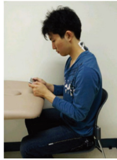
Fig. 2. Middle bending posture