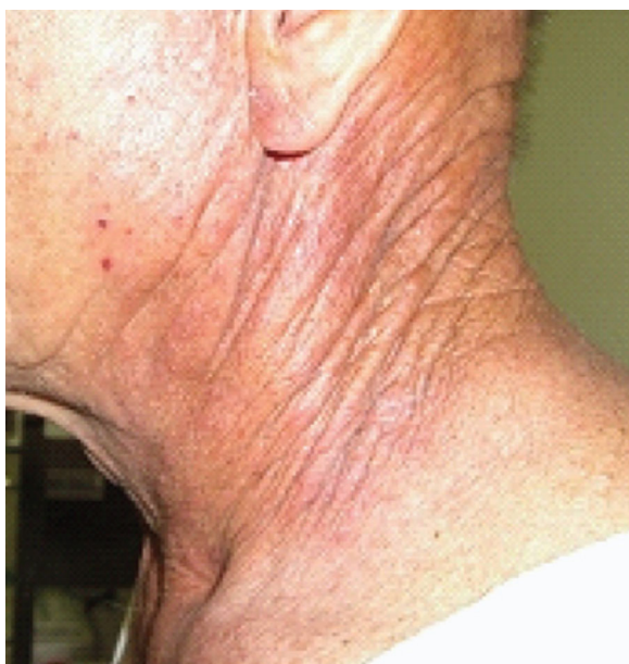
Fig. 1 Grade 1 acute radiation dermatitis.

According to National Cancer Institute Common Terminology Criteria for Adverse Events Version 3