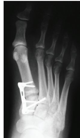
FIGURE 4: Initial postop. Rx showing congruency of the first two columns.

patients. At the final follow-up, the AOFAS score for the mid-foot was 96 points (range, 95–100). The patients subtracted points more often due to mild pain, limitations in recreational activities, and the impossibility of wearing fashionable shoes. As for subjective satisfaction, all the patients reported they were pleased with the procedure and the results obtained. The mean score according to the VAS (Visual Analog Scale) at the end of the follow-up period was 1.4 points over 10 (range, 0–3). All the patients achieved complete weight load at an average of 42.4 days (40–46) considering the initial premise of no body weight bearing for 6 weeks. None of the patients required assistance or braces (for the foot, splints or orthopedic shoes, etc.) after restarting their daily activities. The osteosynthesis material was removed in all patients as scheduled after an average of 17 weeks (range, 16–18). No complications (soft tissue or bone infection, delayed healing, chronic pain, etc.) were recorded.