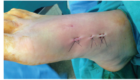
FIGURE 3: Clinical result after MIS Lisfranc bridge plating.

According to the radiological criteria established, the joint reduction was anatomical in four patients, almost anatomical in one patient (#4), and nonanatomical in none of the