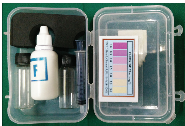
Figure 1: Tamil Nadu Water Fluoridation and Drainage Board field kit

A total of 4989 children were examined, out of which 43.3% were boys and 56.7% were girls. DF was present in 56.9% of the children and was absent in 43.1%. A Dean's score of 0.5,