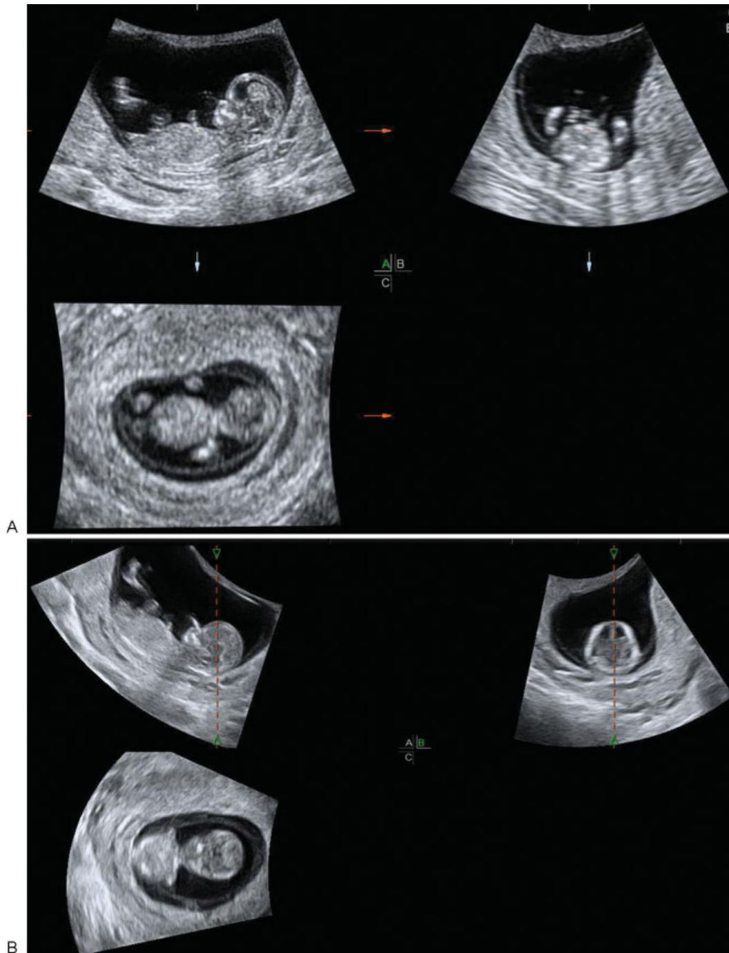
Fig. 1 (A) Three-dimensional volume of a normal first trimester fetus at 12 weeks 4 days displayed in the three orthogonal planes. (B) The reference dot is moved to the fetal head and rotation is performed along the three axes to optimize the plane of the fetal biparietal diameter in plane B. Virtual organ computer-aided analysis is activated using plane B as the reference plane with a rotational angle of 30 degrees along the Y axis. (C) Upon completion of six manual traces at 30 degrees along the Y axis, the volume of the fetal head is automatically generated.

agenesis, left atrial isomerism, situs inversus, single umbilical artery, holoprosencephaly/proboscis, and omphalocele. Of the 19 fetuses, 2 were live born (10.5%). Termination of pregnancy was performed on 13/19 (68.4%). There was spontaneous in utero demise in 2/19 (10.5%). In addition, 2/19 (10.5%) were lost to follow-up. A complete summary of the 19 cases is presented in ► Table 2 .