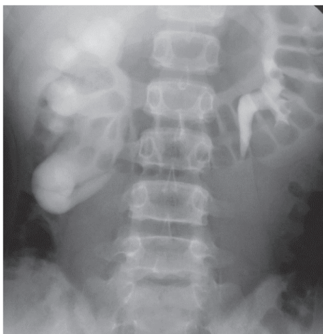
Fig. 1: Intravenous urogram shows right-sided hydronephrosis and dilatation of the proximal ureter up to the level of the transverse process of L3–L4.

Medical records of eight patients with retrocaval ureter who had been treated in Chongqing Children's Hospital between January 2000 and November 2008 were reviewed. The definite diagnosis was made by IVU (Fig. 1), computed tomography [CT] (Fig. 2) and retrograde pyelography. The type of the retrocaval ureter was identified according to the classification by Bateson and Atkinson (5). Intravenous urography had been performed for all patients 12 months postoperatively, as well. Age, gender, hospital stay, treatment modality, treatment outcome and associated anomalies were collected from the patients' data sheets.