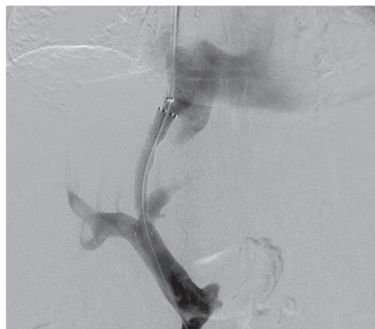
Fig. 1: Image after transjugular intrahepatic portosystemic shunt procedure (8-mm diameter, 60-mm long covered stent was successfully inserted).

Twenty days later, the GI bleeding did not improve and existed persistently. Finally, TIPS (using an 8-mm diameter, 60-mm long covered stent; Fig. 1) was performed followed by CVVH. Two days after the procedure, the GI bleeding was completely alleviated and abdominal circumference dropped to 116 cm with normal liver function. The patient was discharged with maintenance haemodialysis (four hours of haemodialysis three times per week).