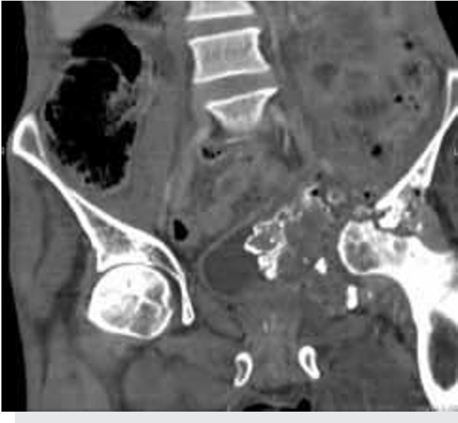
Figure 1. Contrast enhanced abdomen CT showing the iliac bone fracture.

gauge IV line was inserted and 2000 ml of normal saline infusion was started. The abdominal ultrasound scan revealed that there was only a small amount of urine in the bladder. It also showed free fluid in the peritoneal cavity. A contrast enhanced computed tomography (CT) scan of the abdomen and retrograde CT cystogram were ordered. The CT scan showed a 10 cm x 9 cm mass with soft tissue components at the left iliac bone along with a pathological fracture and