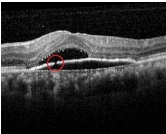
Figure 2 RPE discontinuity and subretinal fluid. Note: Area of discontinuity shown in the red circle. Abbreviation: RPE, retinal pigment epithelium.

18.0; SPSS Inc., Chicago, IL, USA). Independent samples t -test was used to compare the structural and functional outcomes and number of injections between the different groups. P -values <0.05 were considered statistically significant.